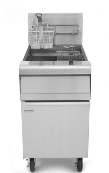
Shown with millivolt controller and optional casters