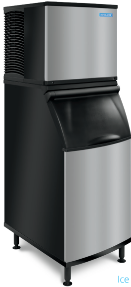
Koolaire KT-0420 Ice Kube Machine on K420 Bin

Koolaire by Manitowoc ice machines are designed, developed and tested by Manitowoc engineers to provide great ice production, energy efficiency and reliable service at an affordable price.