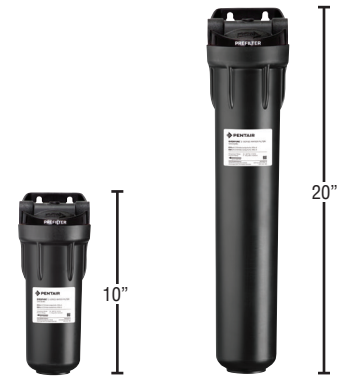
E-10 PREFILTER (9795-80)