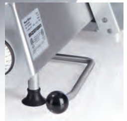
Side Lift arm, included